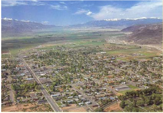
From the Spanish words, "rio severo" or turbulent river